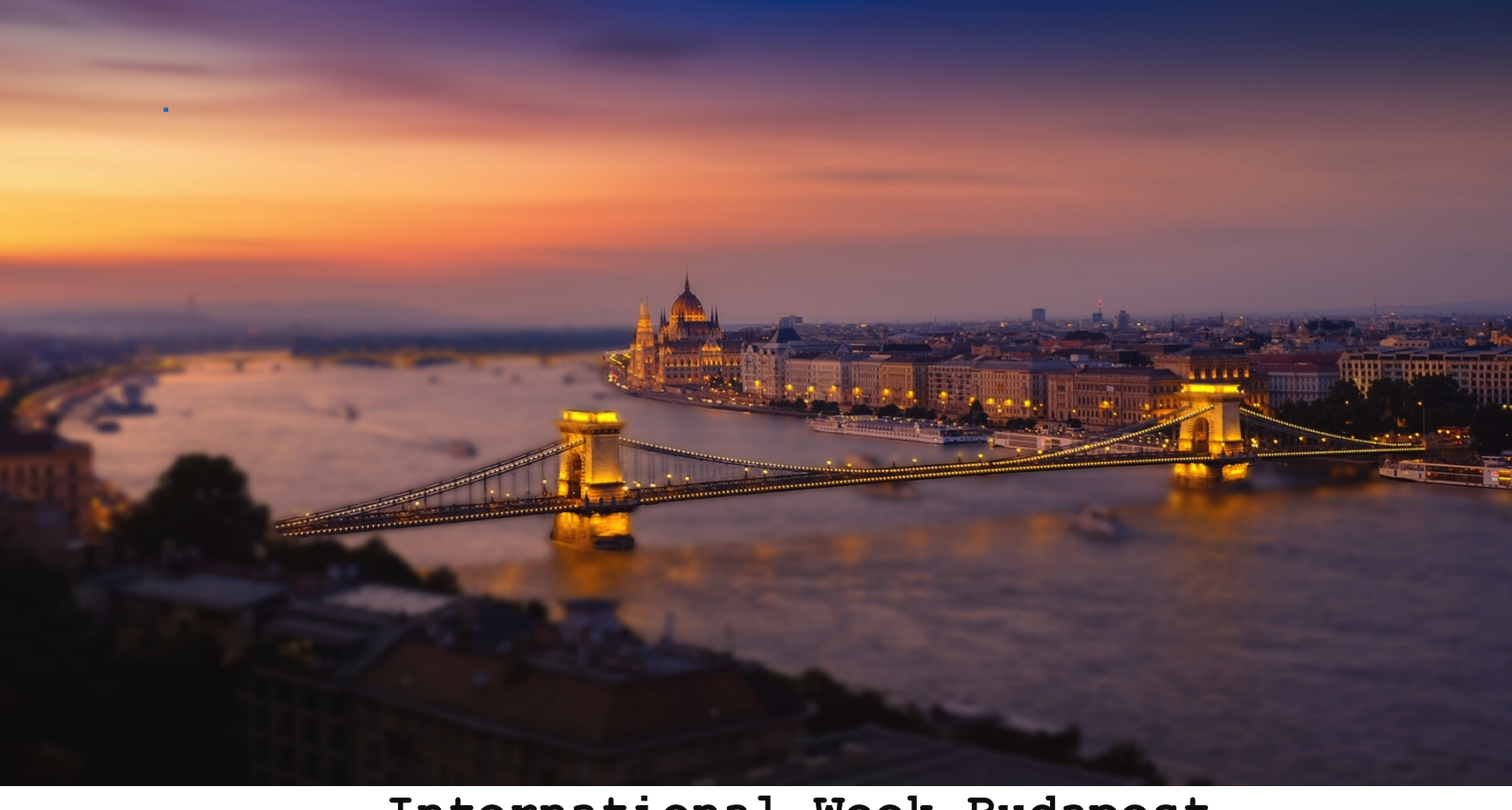
International Week Budapest

May 6<sup>th</sup> - May 13<sup>th</sup>, 2022.